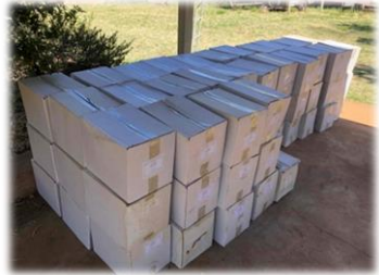
Our shop, stocktake, selling 3558 books and receiving 950 journals.