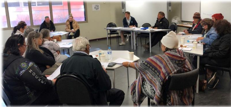
Working together at the IAD Annual General Meeting.

However, much has changed since those early days, in the amount of funding, in fundraising strategies, in organizational structures, in family relations, in the honesty of leaders-- and whether people value money over language and culture.