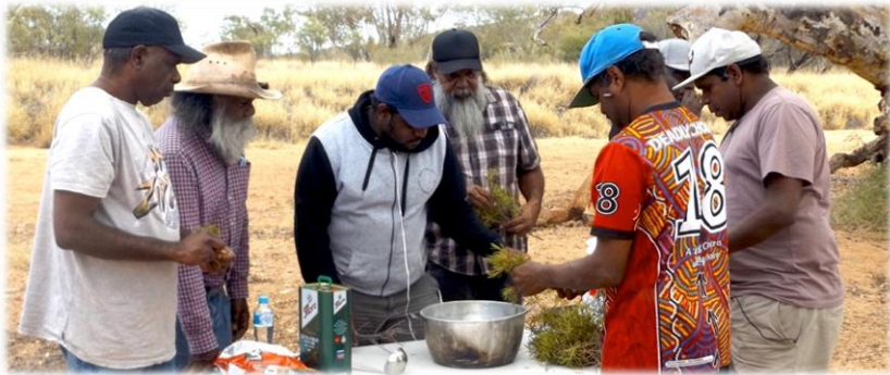
Past IAD cultural leadership program photo.

To help us continue our ways of life in modern times, IAD became a Registered Training Organisation to teach culturally meaningful ways we can continue to contribute to Australia. In 2023 we will begin an Aboriginal 'training of trainers' to teach a wide range of employment skills.